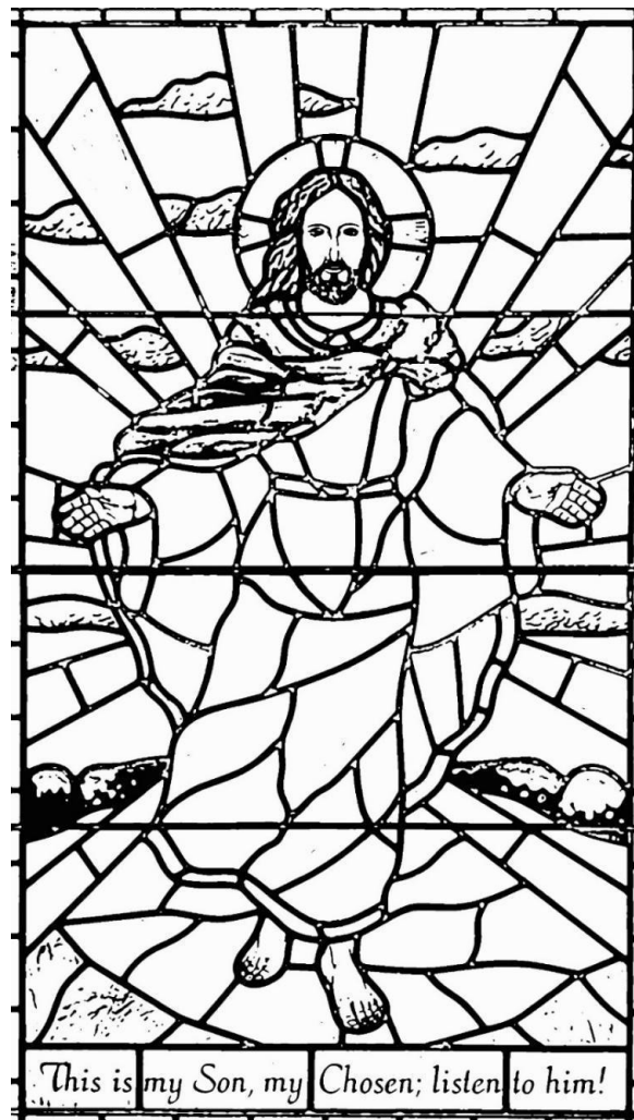
Transfiguration window, located in the stairwell

The Mission of Church of the Transfiguration is to be a Christian community; accepting and inviting all persons to share in worship, witness and service; as disciples of Jesus Christ in the world.